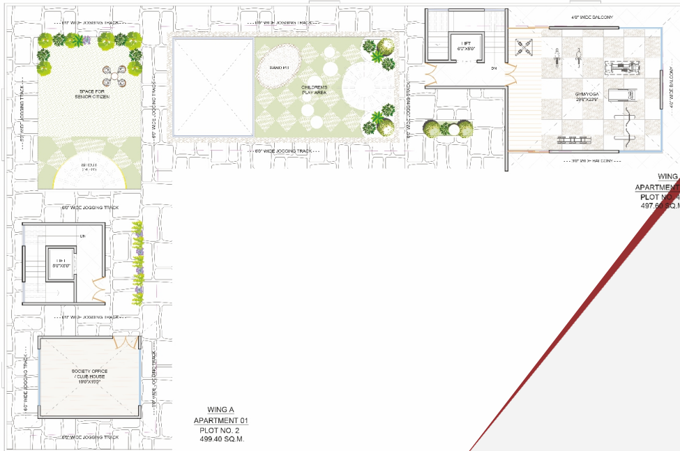
WING A APARTMENT 01 PLOT NO. 2 499.40 SQ.M.